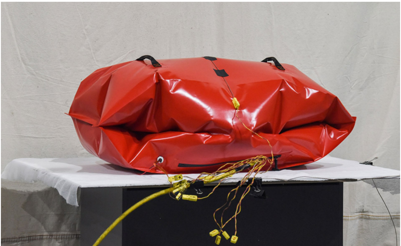
Figure 1: Fire containment product designed to mitigate hazards from lithium-ion battery fires, shown here during testing.

In December 2020, UL Standards & Engagement, along with the American National Standards Institute and the Standards Council of Canada published the first edition of ANSI/CAN/UL 5800, the Standard for Safety for Battery Fire Containment Products. Companies that produce fire containment products can have their products tested to certify that they meet the criteria listed in UL 5800. The standard describes tests for the fire containment of four Watt-hour capacity classes of lithium-ion batteries undergoing thermal runaway. The four classes contain increasingly higher number of battery cells that correspond to the intended containment rating of the product, from small batteries ( \leq 60\text{Wh} ) to much larger batteries ( 161 \leq 300\text{Wh} ).